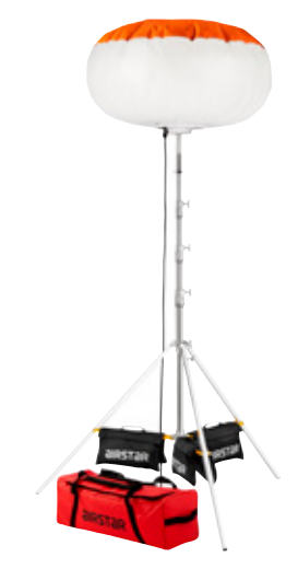
Sirocco Redtech LED 1000: 99,000 lumens / 700 W Maximum light output

Our Sirocco series of lighting is perfect for set, strike, safety, temporary restrooms, parking lots and more. Additional models are available.