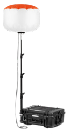
Sirocco LED 6,150 lumens / 60 W Fast setup / Self-contained battery