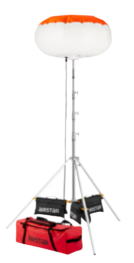
Sirocco Redtech LED 700: 66,000 lumens / 500 W Low power consumption